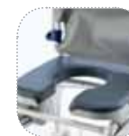
Seating and Backrests

Visit www.safepatienthandling.co.uk to find out more about the Aquatec Ocean Ergo shower chair commode range.