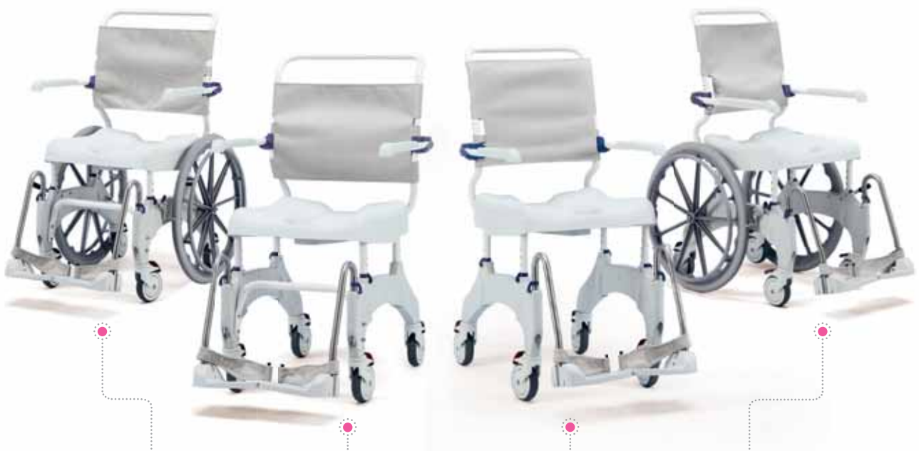
Ocean 24" Ergo XL ▲

An 'off the shelf', modular solution to community equipment provision